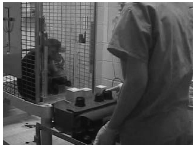
Figure 3. The experimenter places her finger on the baited cup in her array as the monkey watches in the choice phase in the relational matching task with dissimilar stimuli. Note that the experimenter's set is composed of black cylindrical cups and the monkey's set is composed of yellow rectangular cubes.

In the final transfer phase, the subject was presented with relational matching with distracter trials that had an additional modification. In this phase, the experimenter's set of stimuli differed in color, shape, and size from the subject's set (see Figure 3). For example, for each trial in a session, the experimenter's set of stimuli consisted of three black cups of varying sizes and the subject's set consisted of three yellow cubes of varying sizes. In this phase, all trials involved sets of three stimuli (or three choices). A correct search required using a relational size rule to match physically dissimilar stimuli (i.e., the largest black cup with the largest yellow cube). The subject was presented with three of these transfer sessions, for a total of 33 trials.