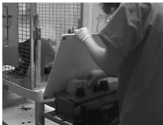
Figure 2. The experimenter places an opaque barrier between the monkey and the experimental apparatus while she baits her cup and the monkey's cup. The photograph also shows the arrangement of stimuli on the experimenter's shelf (above) and the monkey's shelf (below).

Before the start of a trial, the experimenter hid food under the appropriate cups, out of the subject's view. The experimenter then gained the subject's attention and revealed a food item that had