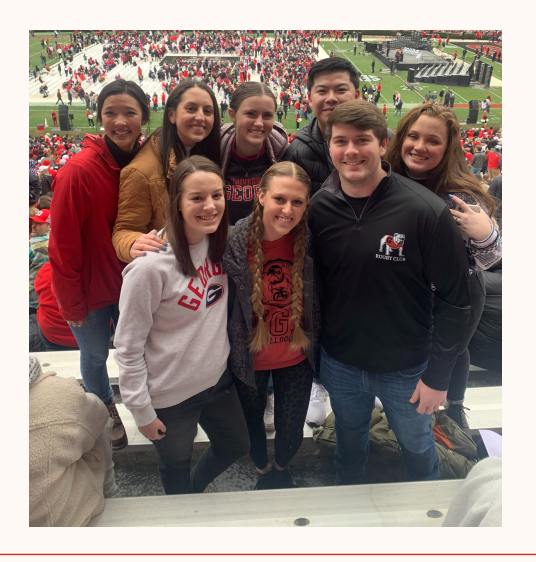
I/O grad students celebrating the UGA national championship win!